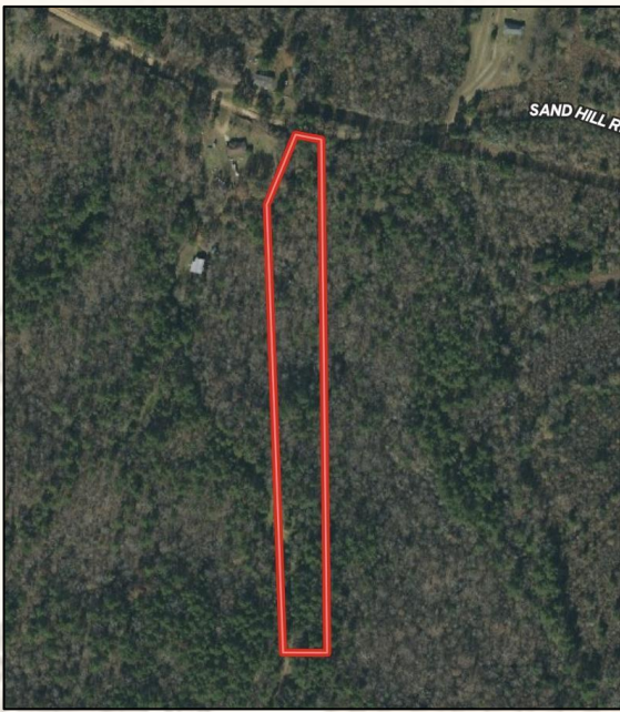
Land id Link