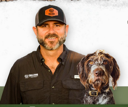
f /25,000+ Followers